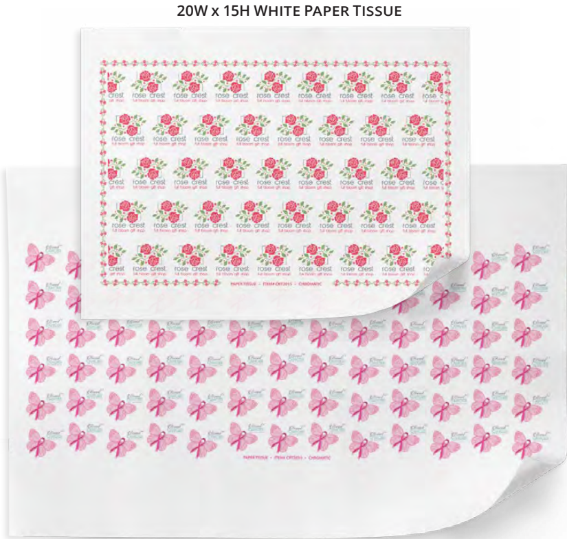
20W x 15H WHITE PAPER TISSUE